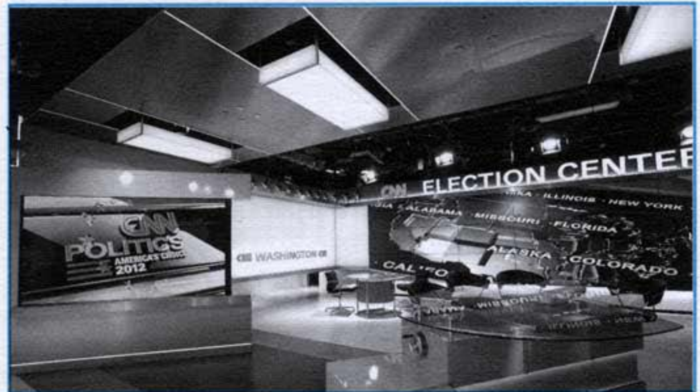
The renovation of CNN's broadcast studios and new Control Room. Photo courtesy of Lawson & Associates, Architects.